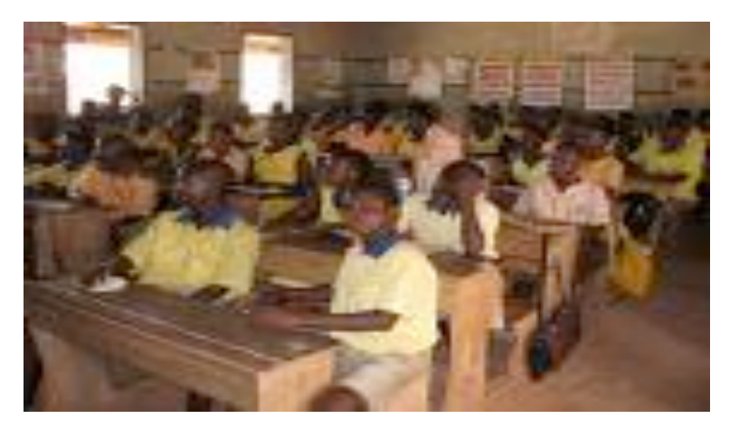
Figure 1 Crowded Classroom

The study sought to explore institutional practices and students' experiences of schooling through an auto-driven elicitation approach. These two variables are dialectically related as instructional practices influence students' experiences and vice versa. The findings indicated that the school place characteristics for example, class size was interconnected with pedagogy and teacher-student relations. This supported findings from previous research that class size differences alter classroom processes and the relationships between teachers and students (Achilles, 1999; Anderson, 2000; Finn, Pannozzo, & Achilles, 2003).