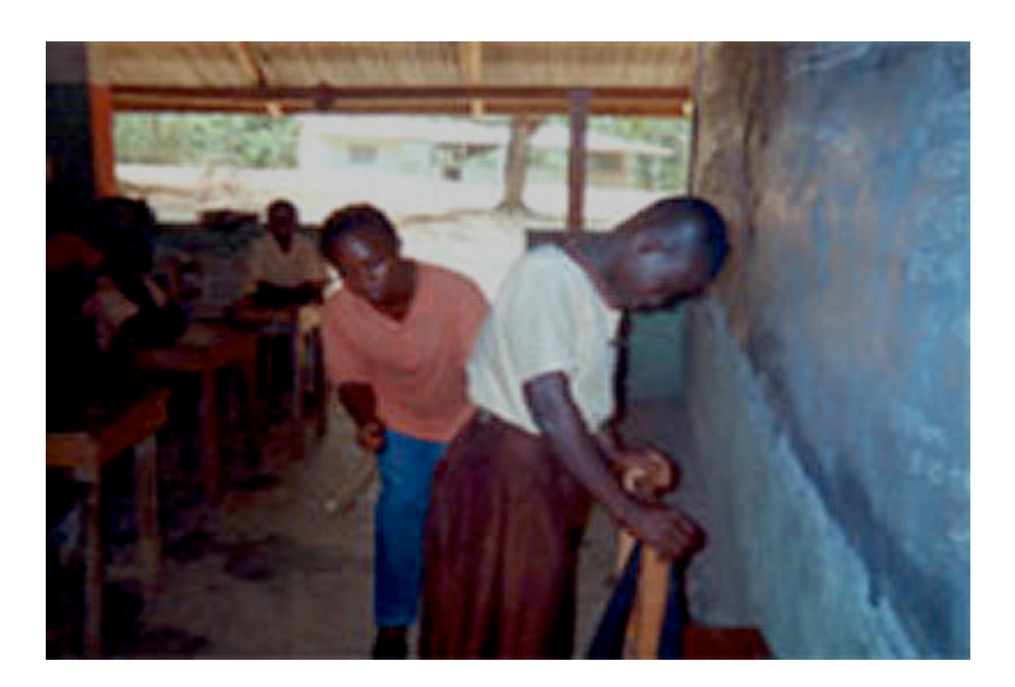
Figure 2 Teacher Wielding Power through Caning

Ellis (2005) argues that the identity of a place itself also contributes to its meaning for inhabitants. The demands placed on teachers due to the large class size were enormous and to manage their classes effectively they resort to wielding of illegitimate powers and aversive approaches, for example, caning to tame and control students. Mutually respectful student–teacher relationship is critical for good teaching and learning but I perceived its difficulty for a teacher dealing with a class of 63 students to implement strategies that value all students.