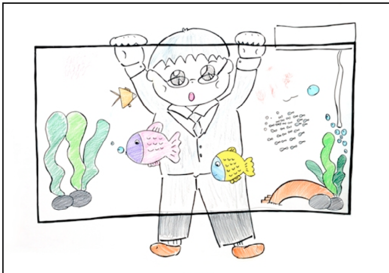
Figure 5. The Aquarium

Six of the images contain a role of the principal as a leader in the context of schooling. This role is usually depicted as a dominant position with the outcome being reliant on the input of the principal. The principal is seen as the overseer and facilitator of inclusive school whose role is critical to the success of the school. The drummer in the dragon boat race, the flutist in the secret garden and the mother hen protecting her nest, all utilize this concept of leadership.