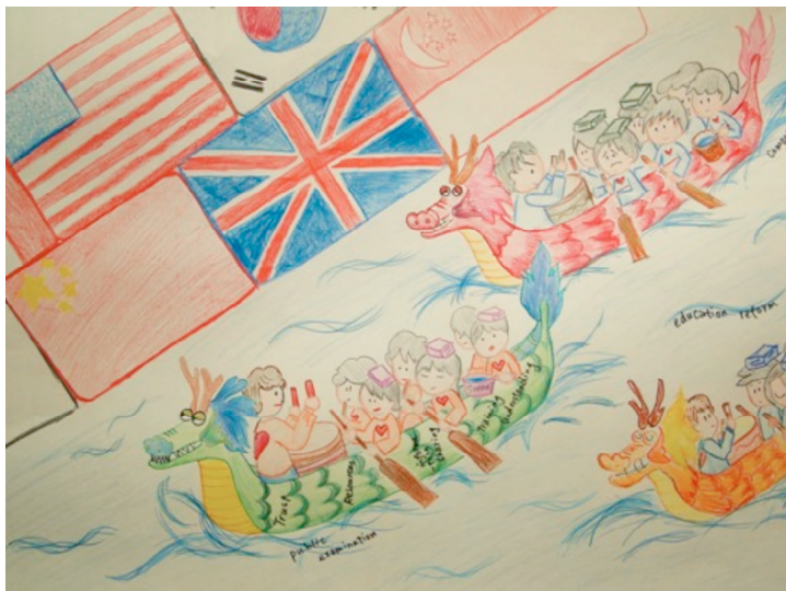
Figure 1. The Dragon Boat Race

In the third image of a dragon boat race, according to the written notation submitted by the group, this "... depicts a sociocultural environment of schooling where teachers, parents and school have to work together for the betterment of the students' welfare and performance" (Figure 1). In this representation the river that is constantly changing and on the move, is conceived as Hong Kong's competitive education system, which comprises continuous reforms.