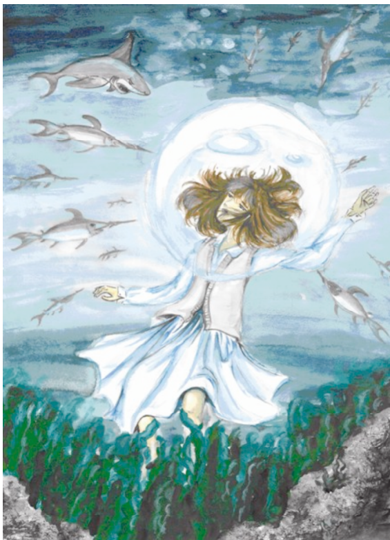
Figure 7. The lady in the bubble

having positive personal identities. The green pasture on which the tree stands is a rich soil that indicates the range of experience gained by the teacher that is considered crucial for the formation of their identity. The birds in the tree are metaphors for teachers' peers who provide collegial support for the teacher. The outcome of all the supportive elements, that is the tree producing big, juicy apples and green healthy leaves, is a personification of the realization of the teacher's goals and expectations. The strong and healthy tree provides protective shades against winds and typhoons to enable children to grow within its umbrella and by nurturing the development of their own tree of knowledge and life. The little plants surrounding the tree represent generations of new life that the teacher is nurturing.