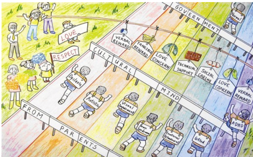
Figure 8. The athletes

Motivation is also highlighted as an effective competency for teachers. This competency is illustrated, for example, in the image of the flutist secret garden where the environment is seen as motivating (Figure 3) and the image of the athletes (Figure 8). In the latter image, students with different learning needs are participating in a hurdles race. Every child is aiming to finish their own race by crossing a number of different hurdles to reach their desired goals. Standing on the sideline are all the teachers and their assistants. The teachers and their assistants are being supportive and encouraging by using intrinsic and extrinsic motivation shown through a bamboo stick hanging rewards over the track (e.g., verbal rewards, tangible reward, love, concern, social caring and technical support), and by the waving of flags.