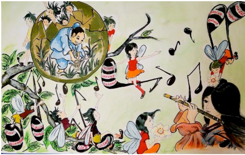
Figure 3. The flutist secret garden

collaboration between the principals, teachers, parents, students and school with images portraying the need for cohesiveness to enable success (for example, the dragon boat race and the tasty soup).