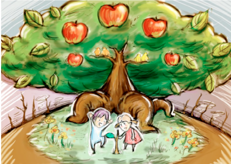
Figure 6. The teacher apple tree

A positive perspective is given by the teacher apple tree (Figure 6). The apple tree is used as an analogy to indicate the teacher's protective and nurturing role. The very strong roots of the tree personify the importance of