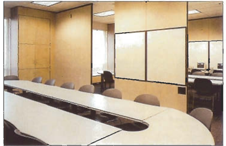
Expandable seminar spaces

“Very interesting combination of design use for school and community. This is truly a ‘community’ facility.”