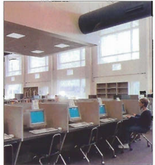
County public library