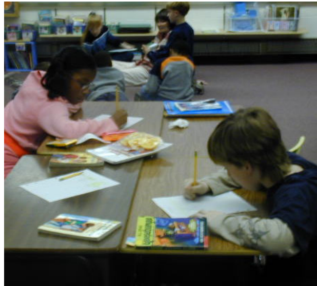
Student with the label of cognitive impairment writing in his daily journal in a multi-level teaching class.