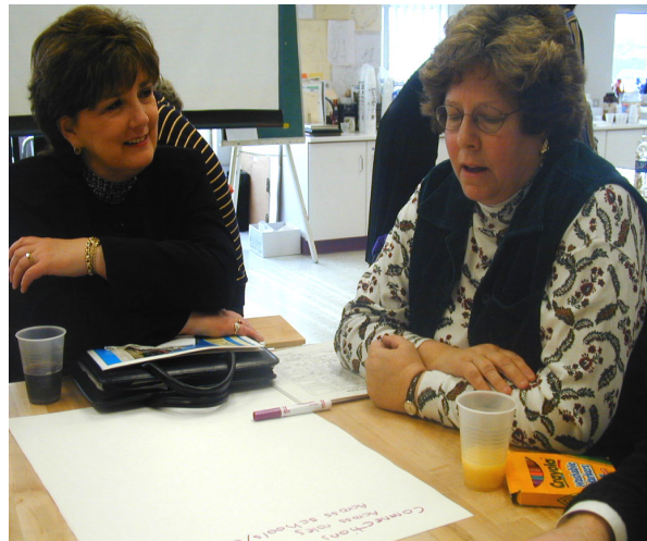
School administrator and parent – researcher dialogue at multi-level teaching forum sponsored by the Michigan Network for Inclusive Schooling.

Michigan Network for Inclusive Schooling. In February of 2001, project staff and leadership of two schools invited twelve schools to form the Michigan Network for Inclusive Schooling as a program of the Whole Schooling Consortium. This effort was a direct outgrowth of the research project involving several project schools, including Hamilton and Armstrong Primary, who provided the initial leadership. The Network has developed a substantive strategic plan, held several conferences, and facilitated school to school interactions and visitations, all towards the goal of strengthening inclusive education in each school and promoting inclusive education in the state.