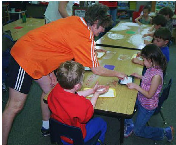
Principal of Sunset Lake Elementary School

We kept narrative records of these conversations and utilized these and other information received from the school to disqualify some schools and select others for site visits. These