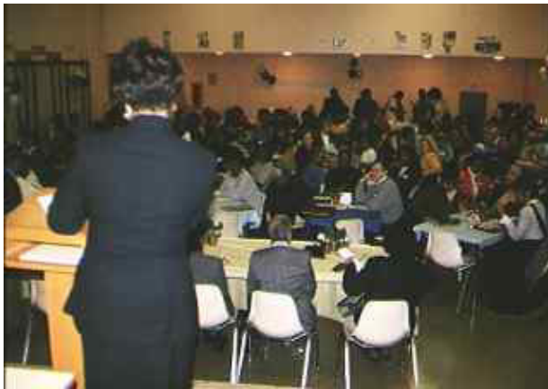
Principal greets gathering of 300 parents from 3 schools to a dialogue on how the schools might be improved.

As the project progressed, parallel research and demonstration projects were underway in both states that allowed us to gather additional information connected with this study. Two